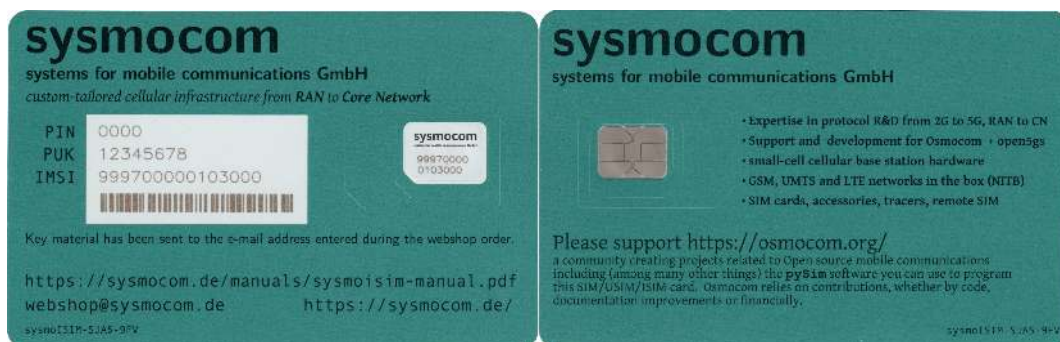
Figure 2: sysmoISIM-SJA5

The sysmoISIM-SJA5 are Java SIM card with the following specifications and features: