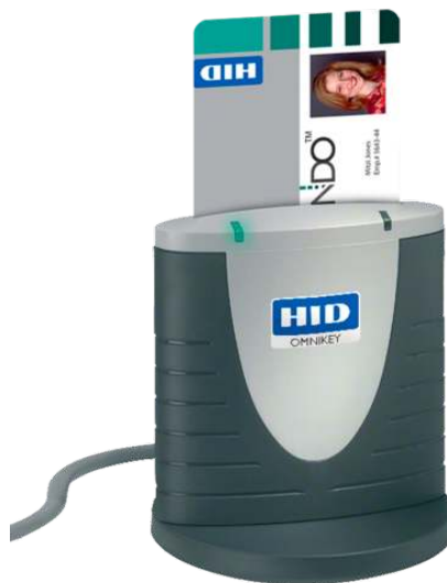
Figure 3: Omnikey CardMan 3121 USB CCID Smart Card Reader

sysmocom offers suitable USB CCID compliant card readers at https://shop.sysmocom.de/SIM/Card-Readers-Writers/